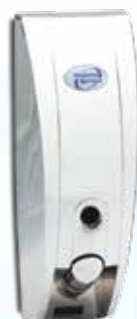
Sanitizing Gel Dispenser Colour: White, chrome Capacity: 400ml

Disinfectants SANIX GEL & SANI GEL clean and sanitize instantly hands and surfaces such as the toilet seat cover, etc. They dry within seconds and are available in 4L containers for use in wall mounted dispensers and dispensers of 350ml, 1 L, 80 ml and individual wet wipes.