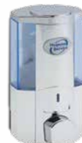
Sanitizing Gel Dispenser Colour: White, chrome Capacity: 350ml